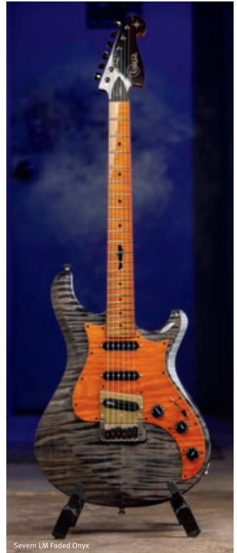
Severn LM Faded Onyx