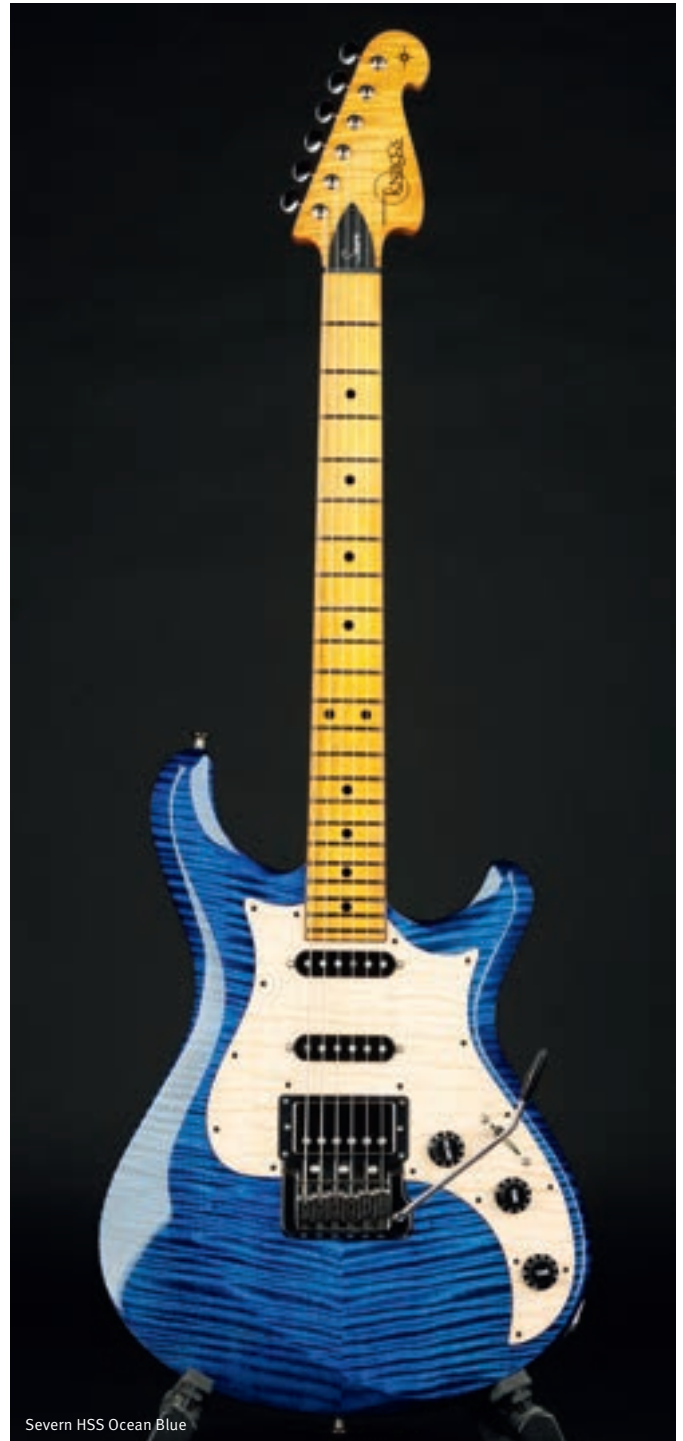
Severn HSS Ocean Blue