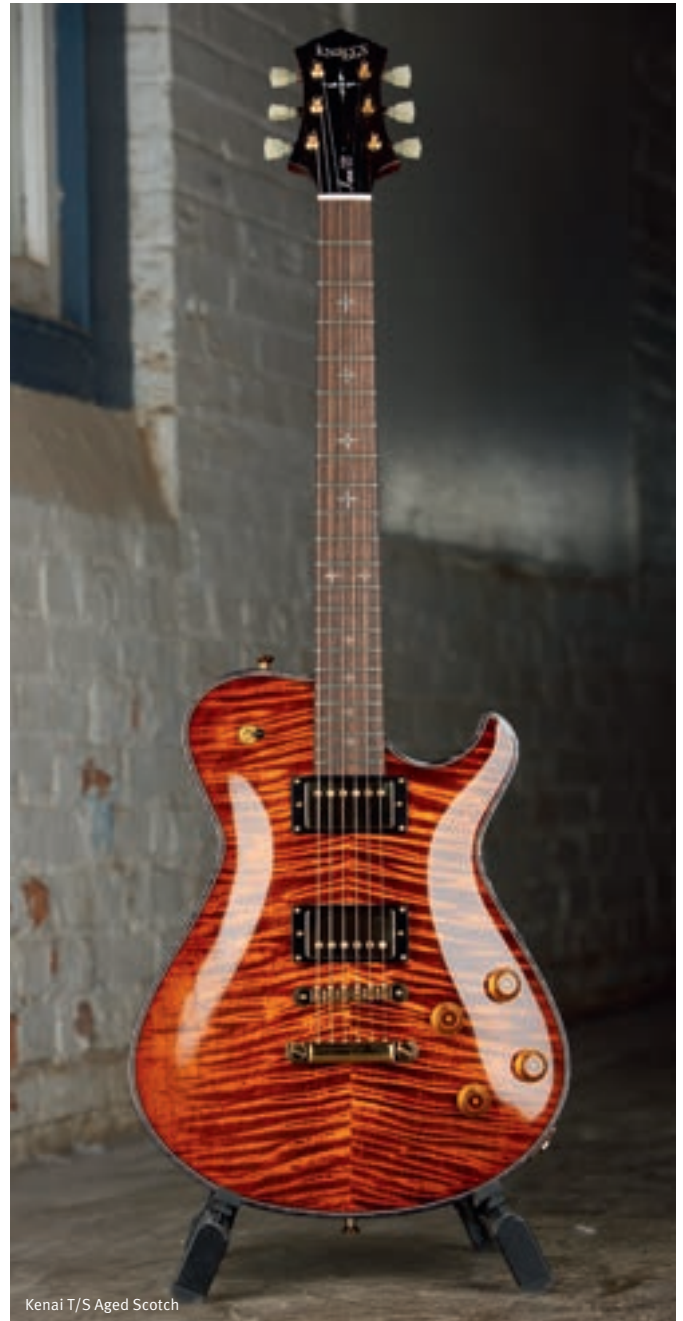
Kenai T/S Aged Scotch