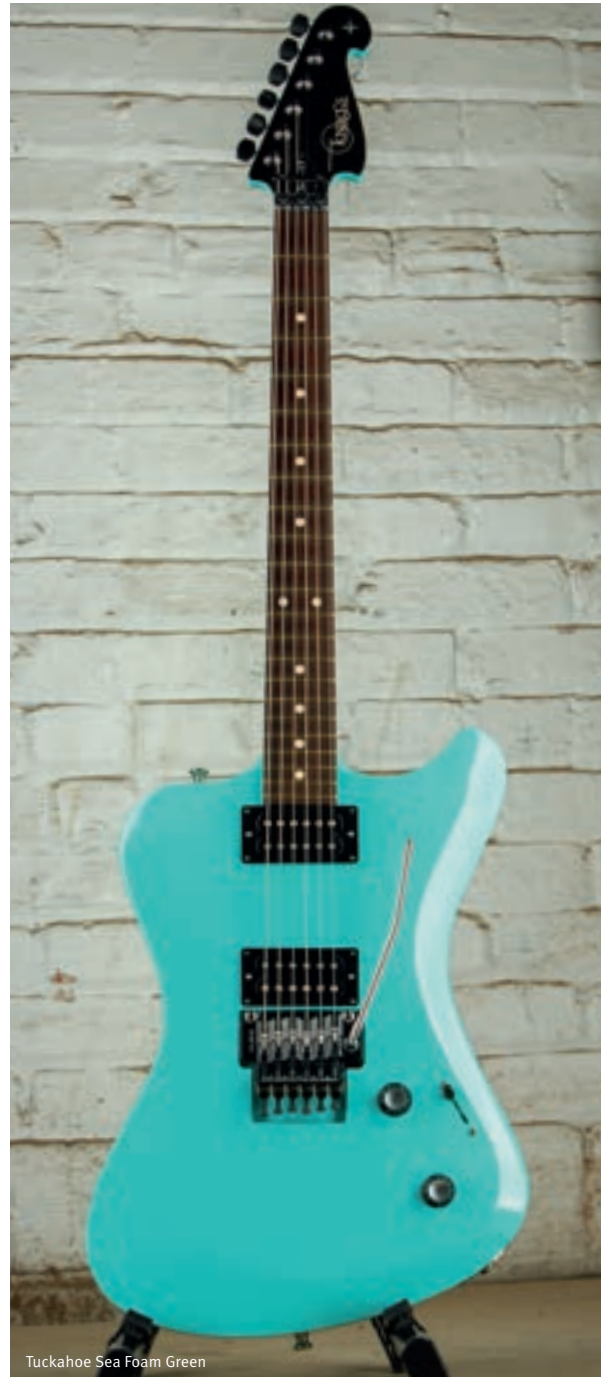
Tuckahoe Sea Foam Green

Sparkle Finishes: Red Sparkle, Blue Sparkle Sparkle, Gold Sparkle, Green Sparkle, Purple Sparkle*