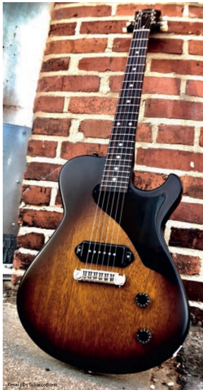
Kenai J D1 TobaccoBurst