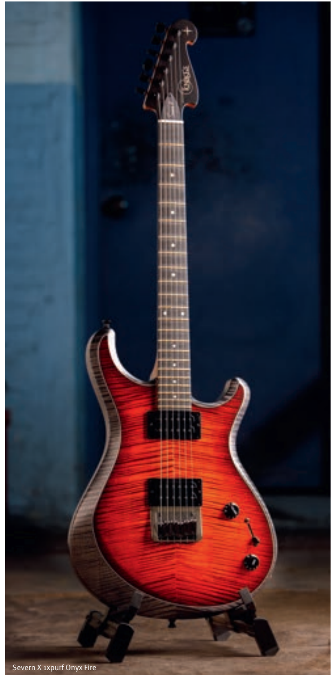
Severn X 1xpurf Onyx Fire

Sparkle Finishes: Red Sparkle, Blue Sparkle, Silver Sparkle, Gold Sparkle, Green Sparkle, Purple Sparkle*