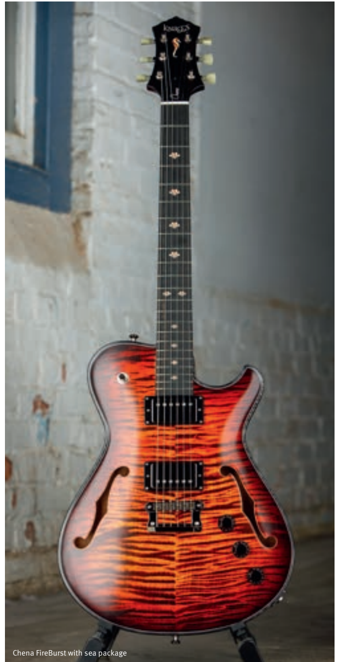
Chena FireBurst with sea package

Available Metallic finishes: Metallic: Gold Top, Candy Apple Red, Cobra Blue, Pelham Blue, British Racing Green, Pink* Metallic w/Stripes: Cobra Blue/White Stripes, Candy Apple Red/White Stripes, British Racing Green/White Stripes* Sparkle Finishes: Red Sparkle, Blue Sparkle, Silver Sparkle, Gold Sparkle, Green Sparkle, Purple Sparkle*