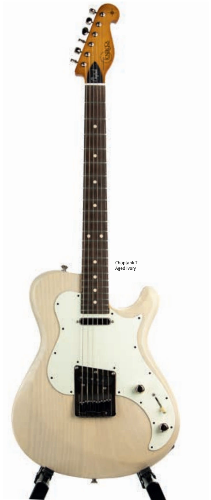
Choptank T Aged Ivory