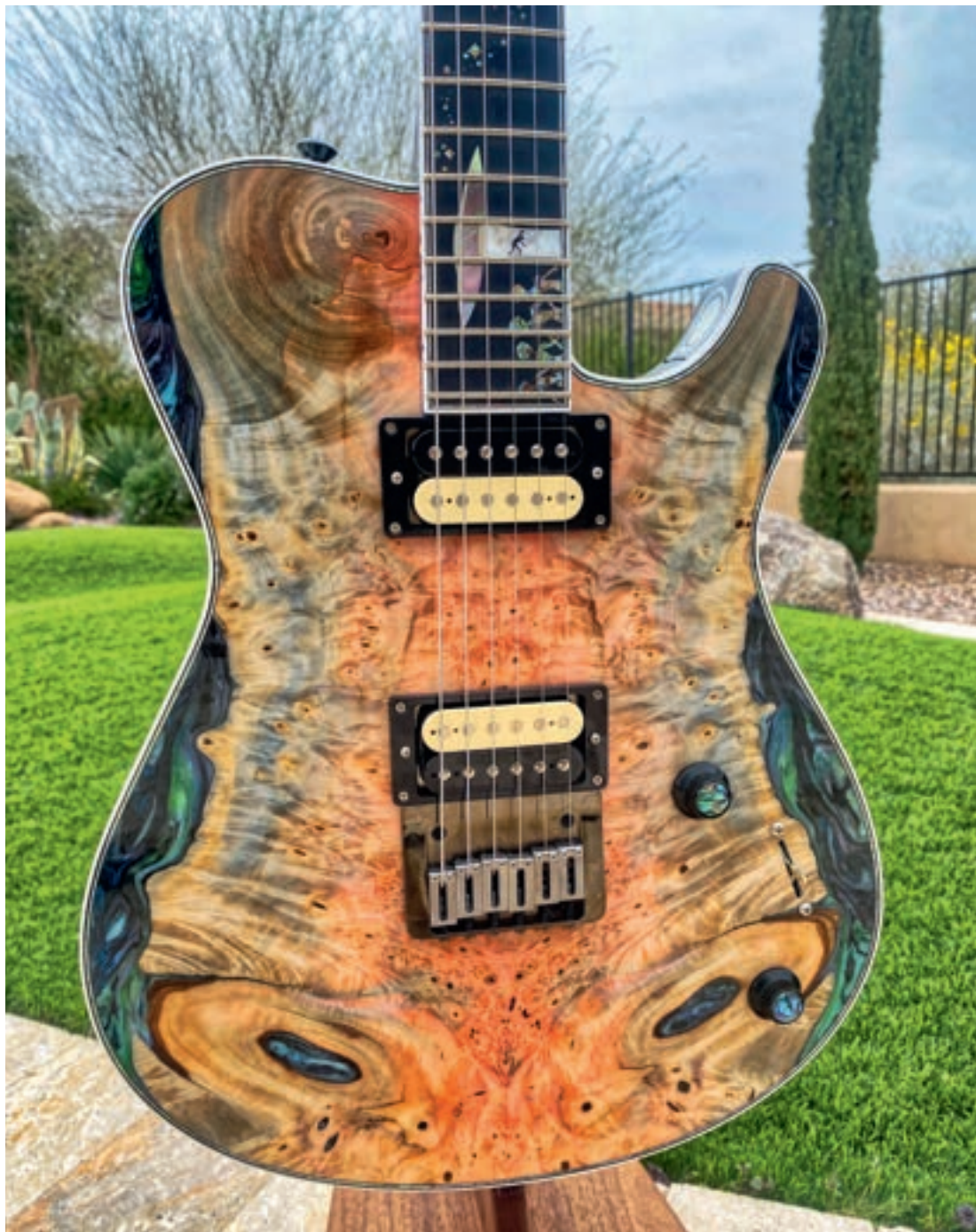
Creation Series ‘The Alien’

These special pieces exist as “one of a kind” never duplicated instruments. As such, they are priced to the dealer as a specific range rather than a fixed price. The customer can specify the concept theme i.e. “Egyptology” as well as model, neck wood, etc but the finished product is seen for the first time upon delivery. Creation Series orders should be discussed preliminarily with an authorized Knaggs representative and ultimately with Joe Knaggs himself.