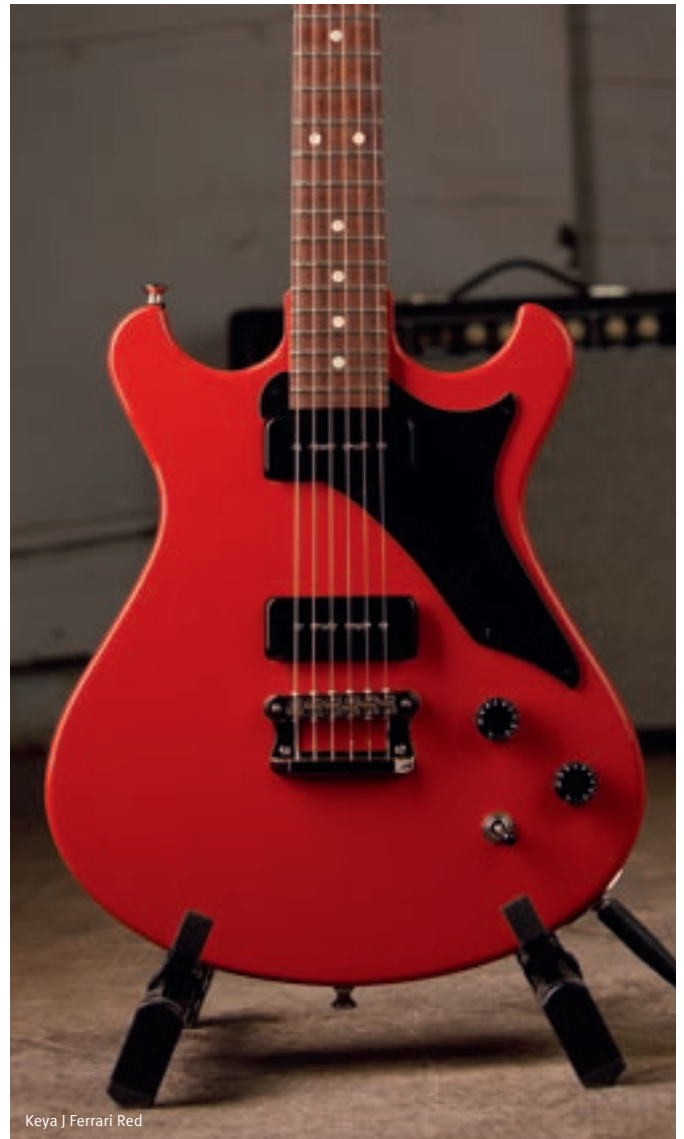
Keya J Ferrari Red