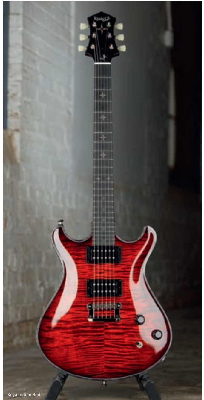
Keya Indian Red

Available Metallic finishes: Metallic: Gold Top, Candy Apple Red, Cobra Blue, Pelham Blue, British Racing Green, Pink* Metallic w/Stripes: Cobra Blue/White Stripes, Candy Apple Red/White Stripes, British Racing Green/White Stripes* Sparkle Finishes: Red Sparkle, Blue Sparkle, Silver Sparkle, Gold Sparkle, Green Sparkle, Purple Sparkle*